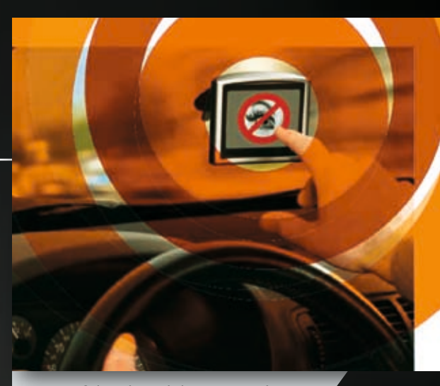
Be careful with mobile sat nav devices

KUDA mobile phone and navigation consoles for HGVs and vans are different and provide optimum safety.